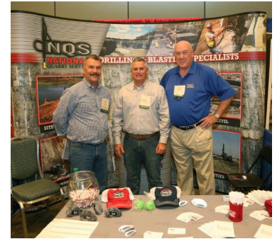
New member National Quarry Services

All conference presentations are on the VTCA web site at www.vtca.org/resources/events/type/vtca_spring_conference_2016/ .