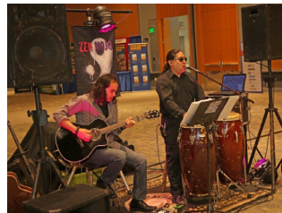
Zen Mojo in the house!